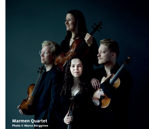
Marmen Quartet

A long-standing favourite of the chamber music repertoire, Debussy's String Quartet conjures up a dizzying array of colours, astonishing beauty, and a huge variety of texture. Written in his early thirties, the music was startlingly unique for its time. One can detect the beginnings of a journey that would later give us masterpieces such as Prélude à l'après-midi d'un faune and La mer , as well as inspiring composers such as Maurice Ravel, whose own string quartet is modelled on Debussy's.