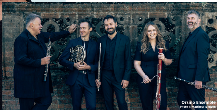
Orsino Ensemble

In a typically wide-ranging programme, Sean Shibe explores French musical connections through music from the 17th century right up to the present day. Scottish lute manuscripts of the 17th century often featured music originating from France, demonstrating a history of strong alliance between the two countries. The spirit of Claude Debussy shines through in Manuel de Falla's Homenaje , and popular dance forms are explored in works by Thomas Adès and Francis Poulenc. Federico Mompou, whose mother was French, writes music of delightful elegance and impressionistic flair.