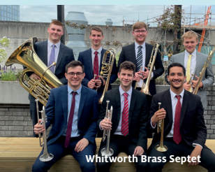
Whitworth Brass Septet